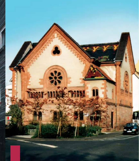
10 Former synagogue A testimonial to the big Jewish church of the town (about 10 per cent of the population); constructed 1898 (New Romanesque); pillaged, disgraced and burned down at the Crystal Night (9 th /10 th November 1938); 1939-1945 stockroom; 1945/46 restoration by the order of the US military government; 1950-1969 clothes factory; 1970 "Weitzelbücherei" – library named after a famous citizen; today: cultural institution (lectures, adult education centre courses, chamber concerts, galleries, cultural cinema).

Tips for leisure time activities ❑ guided city and monastery tours ❑ indoor and outdoor swimming pool in Schlüchtern ❑ campground and swimming pool Heiligenborn ❑ numerous bike paths and hiking trails ❑ recreational areas are Acisbrunnen with game reserve, playground and sunbathing area with Kneipp-site, nature adventure trail (suitable for wheelchairs) ❑ recreation are Neidhof with barbecue area ❑ Bergwinkelmuseum inside Lauter'sches castle ❑ Theatre in the city hall Schlüchtern ❑ Cultural cinema in the culture-house synagogue with current movies and cultural programme ❑ Library ❑ City of Steinau with the Grimm-brothers, castle, historical old town puppet theatre (distance: approximately 6km) ❑ Amusement park Thalhof near Steinau – suitable for young families (distance: approximately 8 km) ❑ Castle of Schwarzenfels in Sinnatal Schwarzenfels (distance: approximately 17 km) ❑ Other facilities and activities: fitness-centre, aviation, golf course, bowling, horse-carriages, jogging club, biking, riding, sauna, shooting-sports, tennis, aquatics in Schlüchtern und surrounding Ask at our tourist information centre!