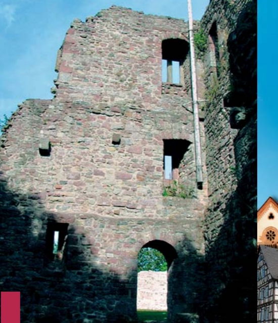
C Ruine castle Steckelberg ... in the district Vollmerz: distance approx. 8 km Castle Steckelberg was built in 1388 and was restored in 1509; today there are remains of the wall. It is the birthplace of the controversial knight, humanist and poet Ulrich-von-Hutten (1488-1522). His description of the life in a castle by 1518 is well-known. Nice view over the Kinzig valley to Schlüchtern from the ruin – about 450m high.