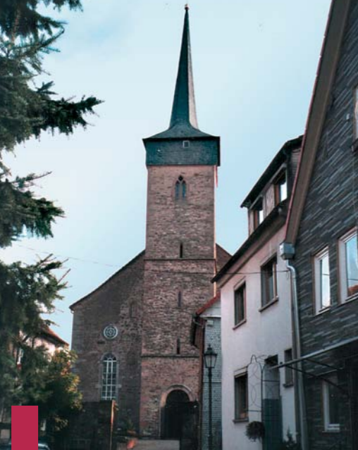
9 Protestant town-church St. Michael Built about 1100, hallowed to the archangel Michael (city arms), 1196 integration into the monastery (mentoring of the non-monastic community); damages from the Thirty Years War between 1688 and 1694 are repaired; 1838 to 1840 rebuilding of the nave (classic stylistic elements); 1950-1953, 1974 and since 2005 interior renovation. In the previous town there is a graveyard next to the town church there is a memorialgraveyard for 342 war victims.

11 (without Illustration): former regional administrator's office of the region of Schlüchtern, Gartenstraße of the year 1910 (Art Nouveau); 1974 -2005 main administration office of the Main-Kinzig-Kreis.