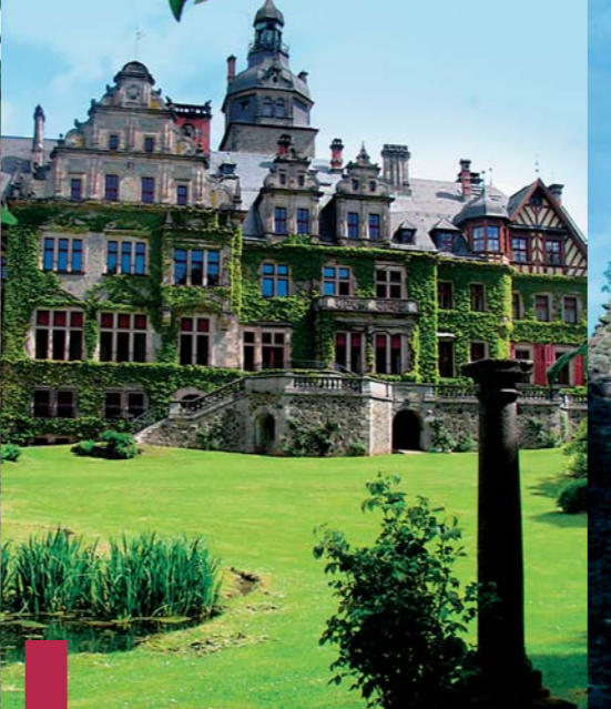
B Castle Ramholz ... in the district Vollmerz: distance approx. 8 km With an estate, a forester's house and a family's burial place: built in 1893-95 under the inclusion of the old Hutten castle as a reproduction of the "English Renaissance". The extensive palace garden planted according to the ideas of the sovereign Pückler-Muskau in the style of classical English territory gardens is accessible to visitors but not to the castle itself.